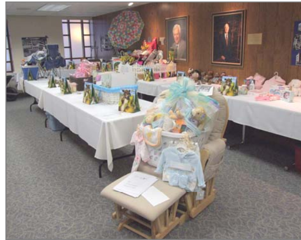
Pictured chair given by CFM faculty & staff

This year, all proceeds will go towards the Family Medicine Residency Rocking Chair program. Each year, at least 12 rocking chairs are presented to new mothers. With the basket raffle this year, the program will increase the amount of chairs given. During a home visit to the mother and infant, our Family Medicine residents present a rocking chair which is helpful in the bonding process. Our residents and faculty have donated baskets and participated in the Basket raffle. Hospital administrative staff sold tickets in the Williams Board room. Over $5,500 was raised this year for rocking chairs.