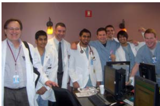
All male OB team...how did this happen?