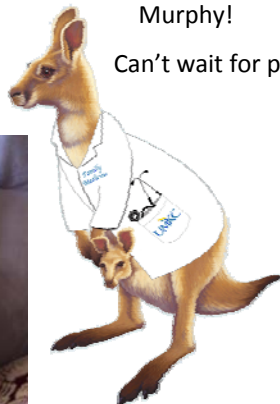
Jackson Trimm, born June 16, 2010